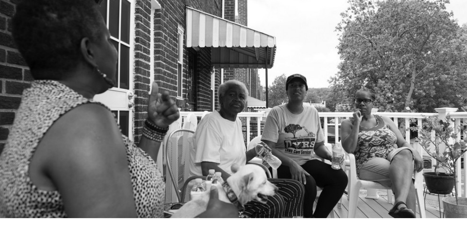
The DC Government made historic investments in affordable housing over the past five years. Key initiatives include: